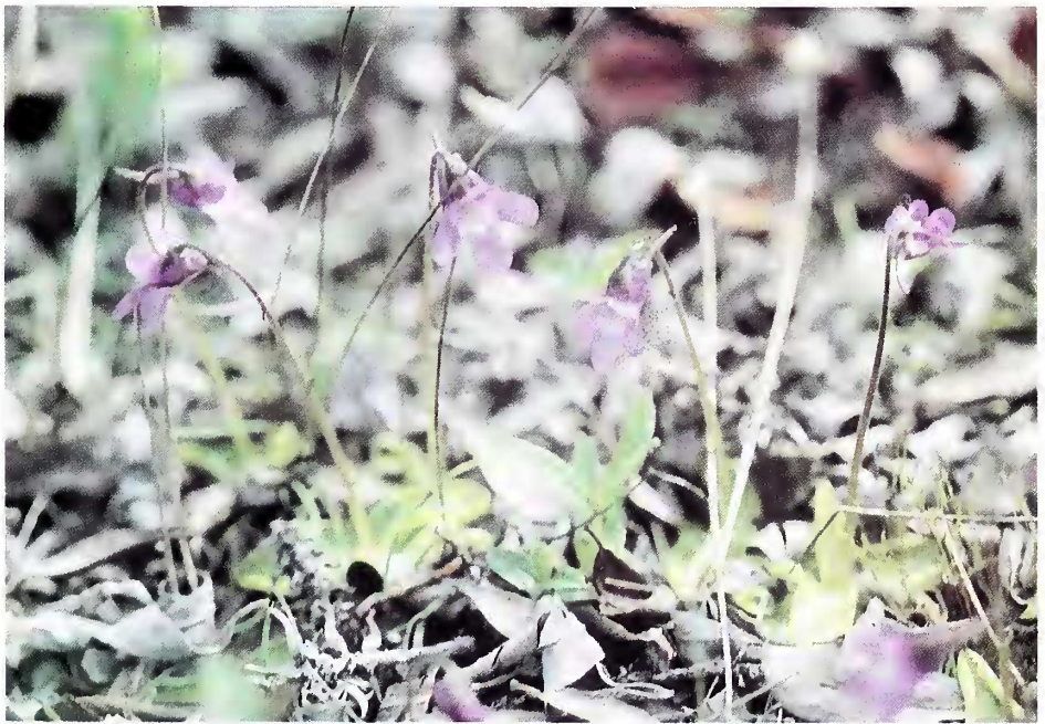
Group of pings in bloom along open ground.